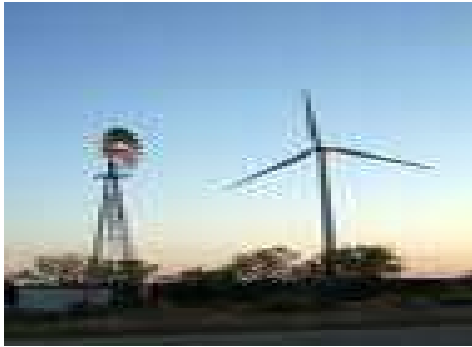
Fig. 2 showing a wind mill utilising wind as a renewable resource