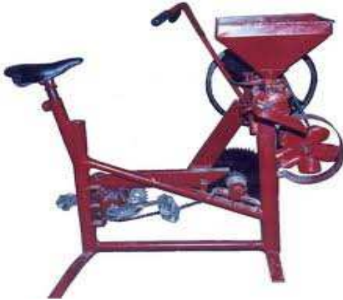
Fig. 1 An example of intermediate technology: Gym bicycle which also doubles as grinding machine

However, the use of intermediate or appropriate technology should not mean that developing countries are abandoning modern technology which is still the cheapest and most efficient way of producing large quantity of good quality products demanded by the market. Modern technology must and will continue, and it cannot be replaced by appropriate technology. Intermediate technology is a complement to modern technology, and both should exist side by side in the same society.